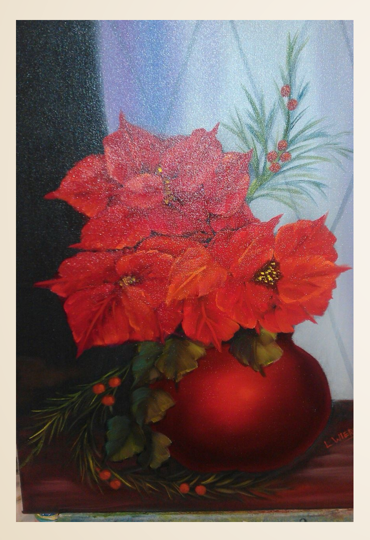
"Red Flowers in a Pot" by Larry Weirs

Saturday, December 2nd , 2023 from 1: 00 pm to 4:00 pm. $65 WAL members, $75 Nonmembers.