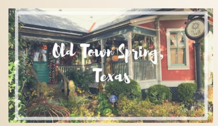
Old Town Spring

WAL Plein Air Group - December 14, 2023 from 9:30 am to 12 pm in Old Town Spring.