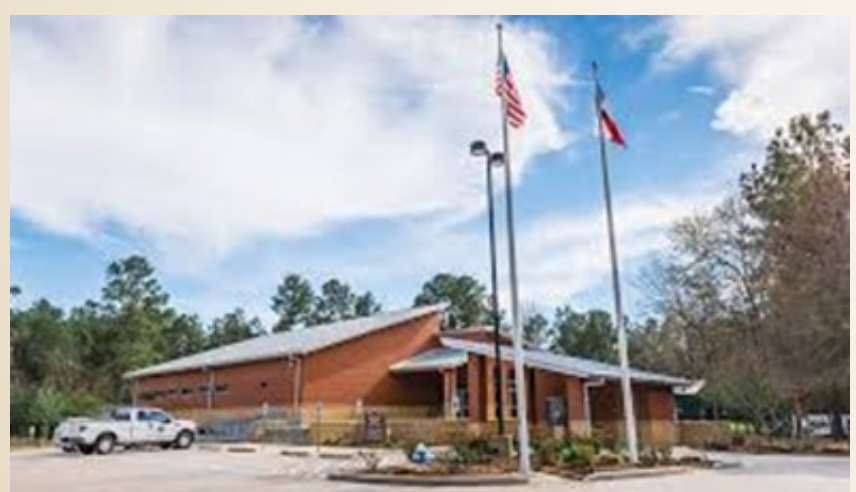
Spring Creek Greenway Nature Center