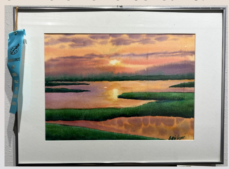
"Marsh Scape" by Beth Weaver

Please visit the Woodlands Art League to see selected artwork of the LSAG Show winners, most paintings are available for sale!