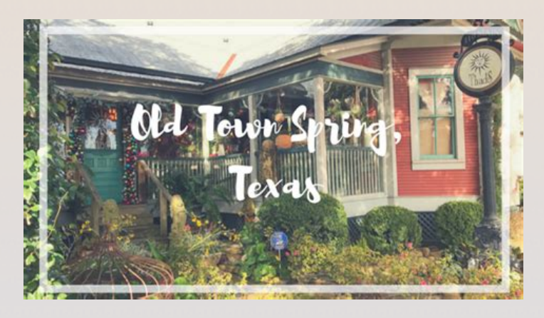
Old Town Spring

This is the last location where Paint Out Group met in December 2023.