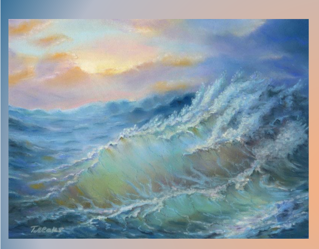
"Ocean Escape" 3-Day Pastel Workshop with Tetyana Aleksenko