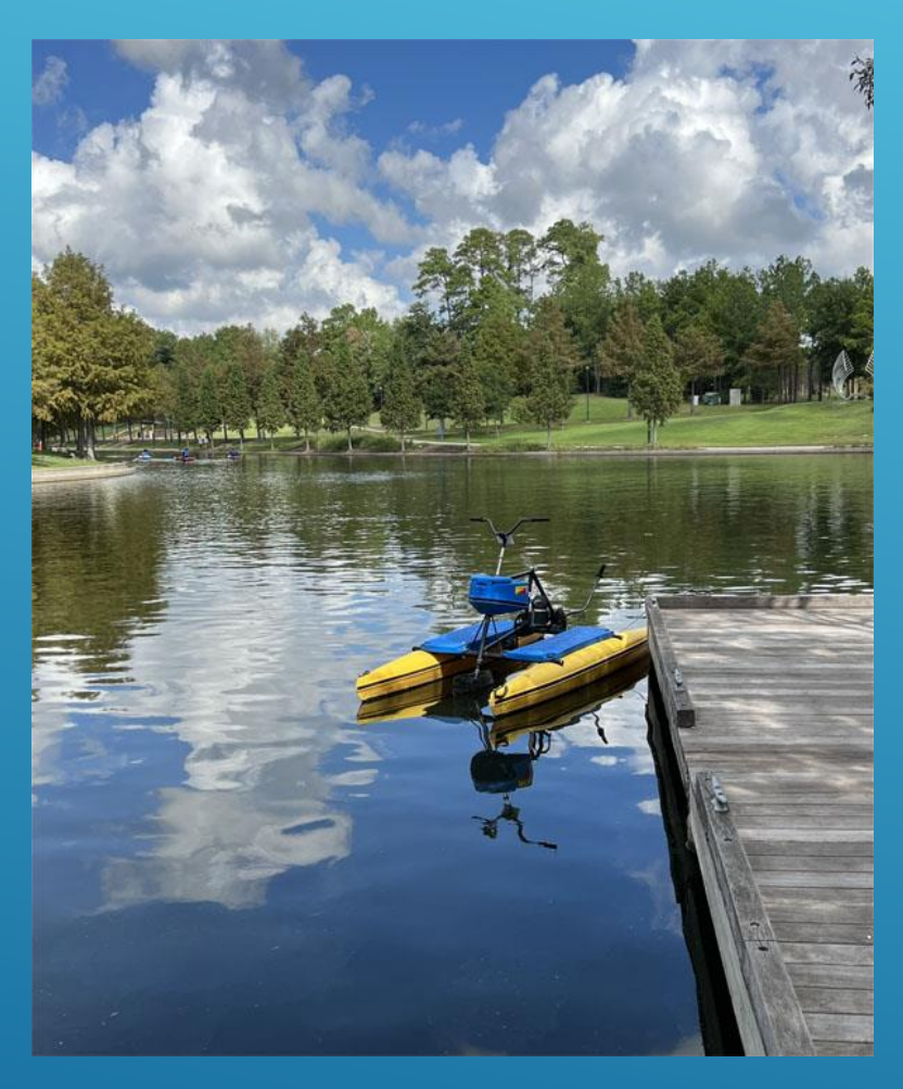
Woodlands Waterway Boathouse

Woodlands Waterway Boathouse Paint-Out on Thursday, February 29, 2024 at 9:30 am.