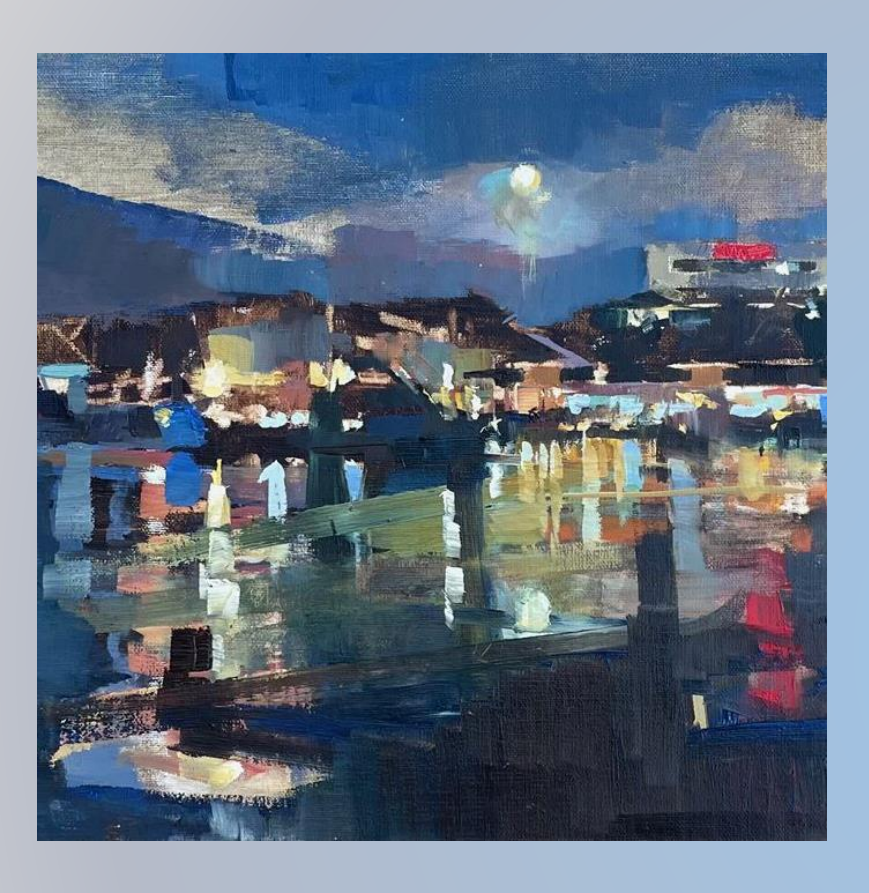
Nocturne Plein Air Workshop with Krystal W. Brown