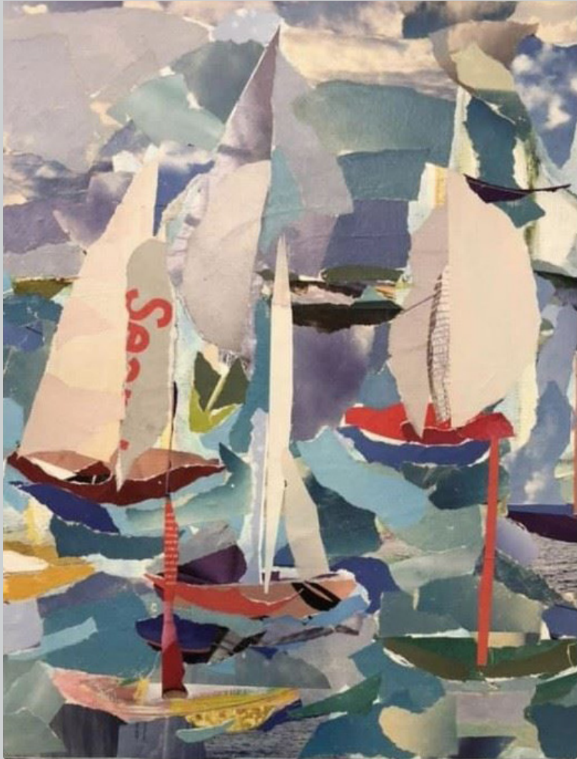
“The Race Is ON.” Collage on canvas, 18x24 in. by Jim N. Hill