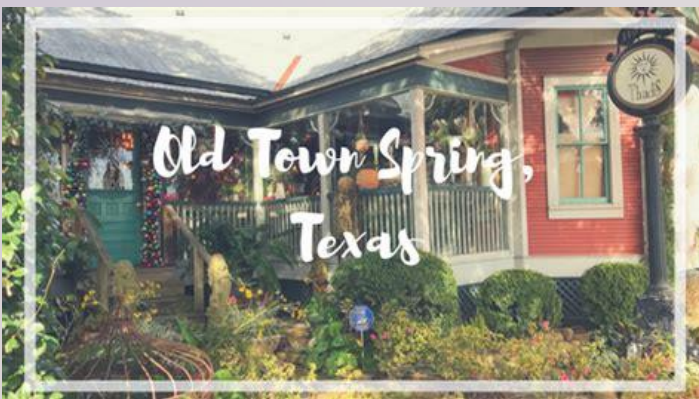
Old Town Spring

WAL Plein Air Group – December 14, 2023 from 9:30 am to 12 pm in Old Town Spring.