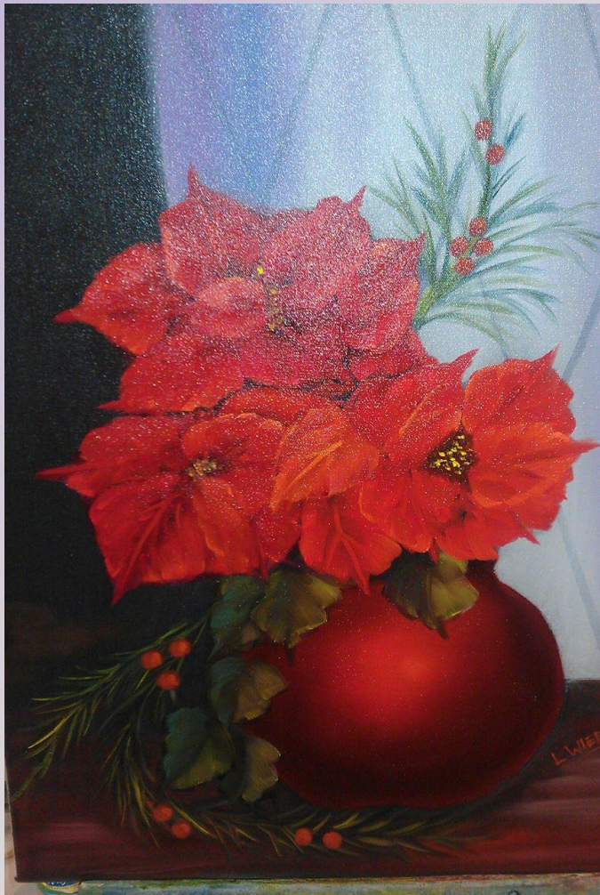
“Red Flowers in a Pot” by Larry Weirs

Saturday, December 2nd, 2023 from 1:00 pm to 4:00 pm. $65 WAL members, $75 Non-members.